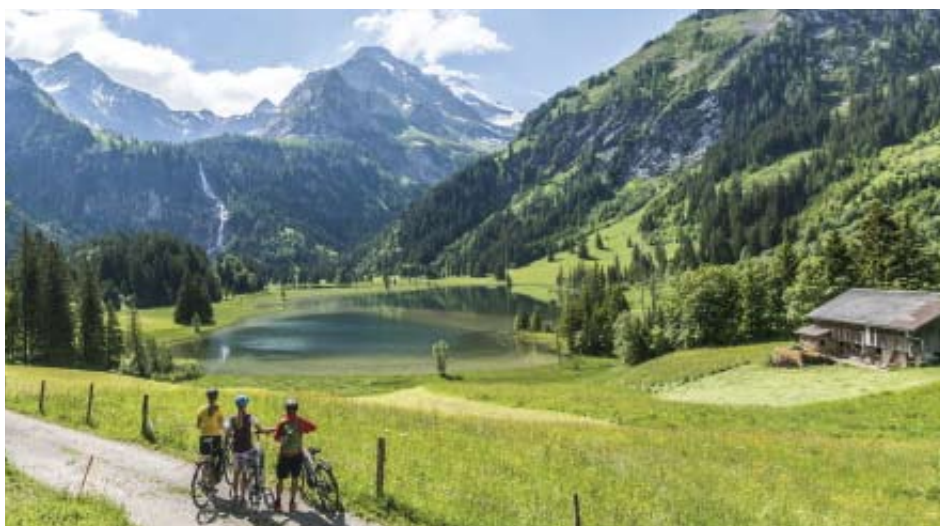
Mountain Biking at the Lauenensee