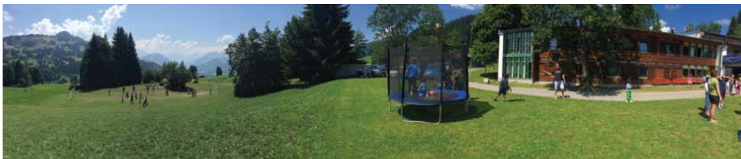
So much to do around the Mountain Lodge