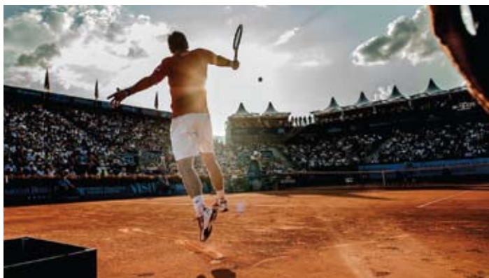
Swiss Open Tennis Tournament

Just relaxing with friends, bouncing on the trampoline , a pick-up game of football or volleyball and slack-lining are favourite free-time activities. Campfires are always entertaining, singing songs , practising for skit nights and showing off skills at our talent shows all come together to create an experience of a lifetime! Our senior campers can expect to be busy creating and hosting our traditional Carnival Night for the junior campers. Every summer we introduce new and exciting excursions , such as wakeboarding , scuba diving , exploring and shopping in the capital, Bern or other remarkable Swiss cities and of course splashing around at the Aquaparc . Campers will have the opportunity to experience major world class events like the Gstaad Beach Volleyball Tour , Swiss Tennis Open , the Menuhin Festival and the Hublot Polo Cup . The calendar is jam packed with events and it is guaranteed to be an unforgettable summer with Lovell International Camps!