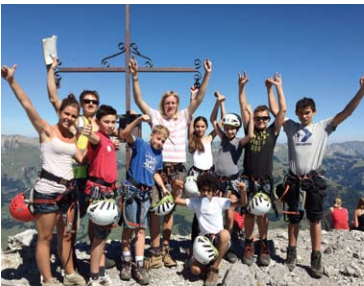
Conquering the Rüblihorn Via Ferrata - 2285 meters