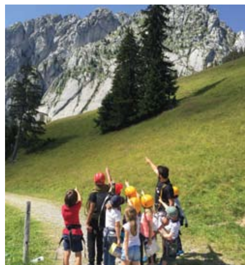
Rock Climbing at the Wandflue