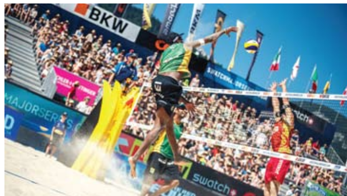
Beach Volleyball World Tour Stop - Gstaad