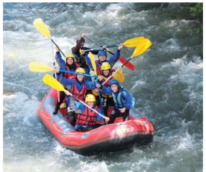
Rafting the Sarina River